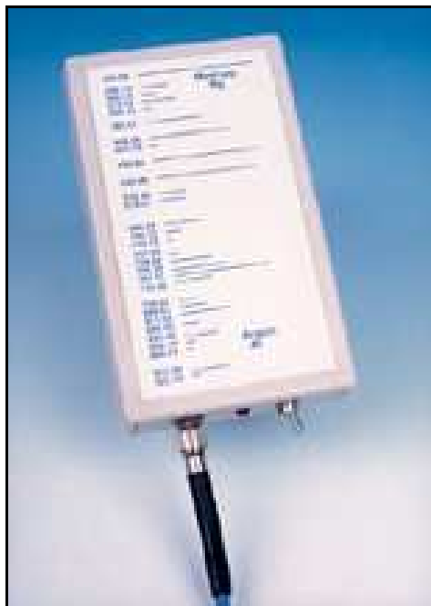
HG-1 Mercury Argon Calibration Light Source

The following sections detail the features of the HG-1 Mercury Argon Calibration Light Sources.