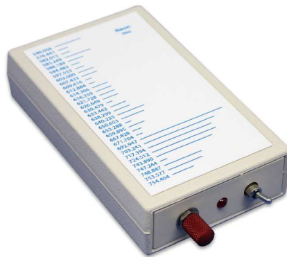
XE-1 Xenon Calibration Light Source

The following sections detail the features of the XE-1 Xenon Calibration Light Sources.